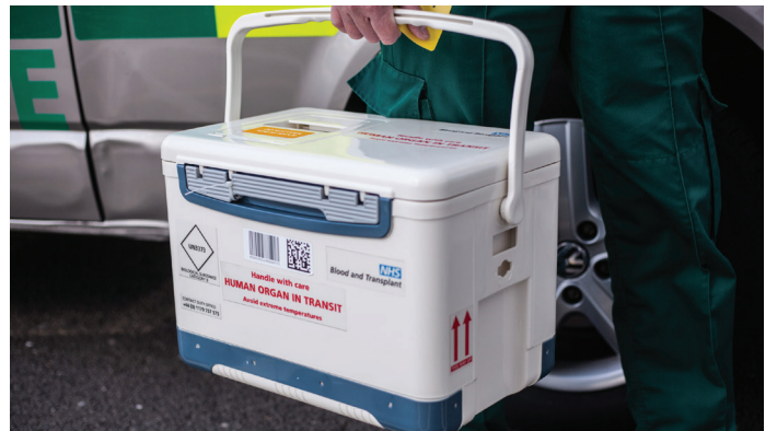
Blood & Organ Transport